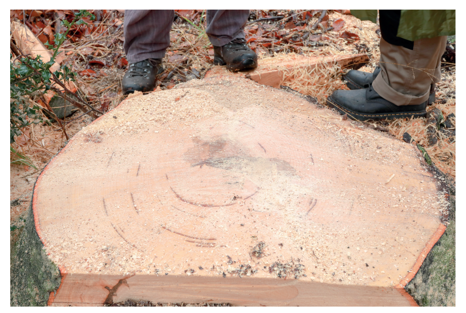
* Breakfast: buttered bread, tea, coffee, peppers, big sandwiches...

It wasn't long before my reflex to capture these moments took hold through a tender, admiring gaze. I was grateful to memorizing these attentive moments, we were purely in the present and we were all purely intent on taking care of the only place that would allow us to have this kind of experience.